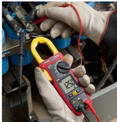
AMP-320 AC/DC Clamp Meter Electrical Motor Maintenance