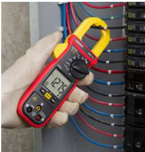
AMP-310 AC Clamp Meter HVAC