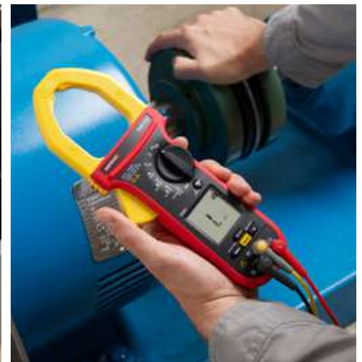
AMP-330 AC/DC 1000 A Clamp Meter Industrial Motor Maintenance