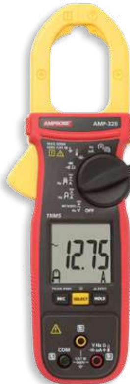
AMP-320 AC/DC Clamp Meter Electrical Motor Maintenance