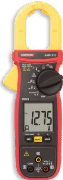
AMP-310 AC Clamp Meter HVAC