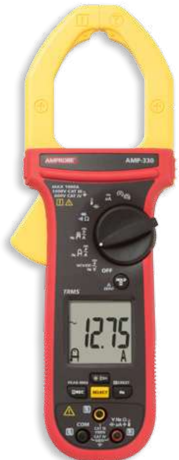
AMP-330 AC/DC 1000 A Clamp Meter Industrial Motor Maintenance