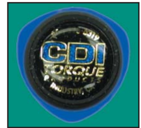
Trilobular Comfort Grip